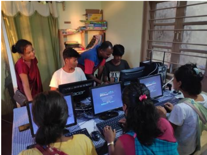
The Computer Literacy project in Patharlyndan hitting fourth gear